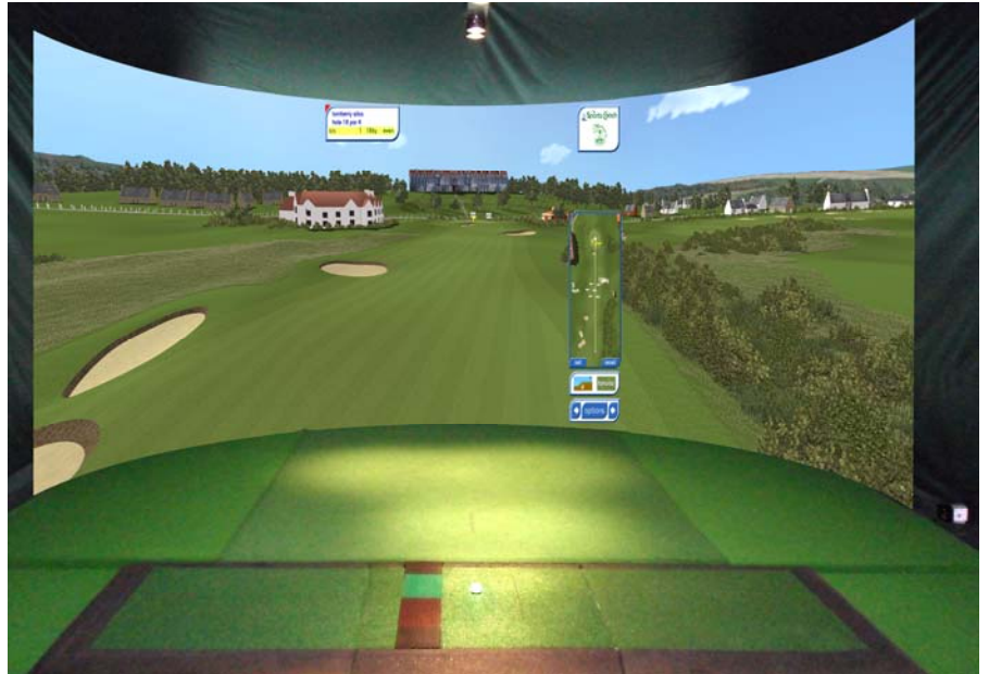
Surround Simulator Made to Measure, Featuring: Celtic Manor 2010

Has been launched in record time, due to the superb GPS Golf Simulation engine being graphically superior. The three projected images are blended together seamlessly, giving an enhanced gaming experience. Those in the golf industry that have tested all competitive simulators, truly believe that this is without doubt the most advanced golf simulator that has ever been produced. Featuring 3 high quality projectors, an ultra wide projected strike screen and the enhanced control system. Allowing golfers view to be fully immersed within the golf course environment.